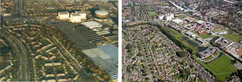
Fig. 1. (a) Campus site in 1978 was brownfield; (b) Evolution from industry to university campus and public space in 2012.[9]