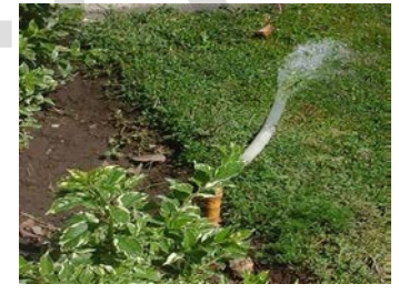
Fig. 10. Flooding irrigation.